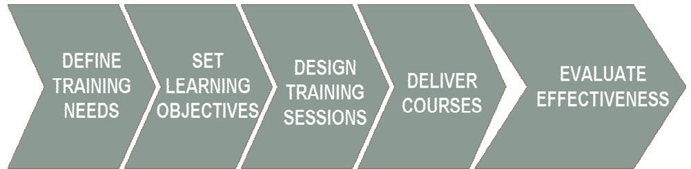
The Training Design & Management Process