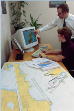
Training on the use of SARIS for Search Planning