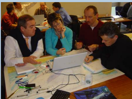
Training in the Theory of Search Planning